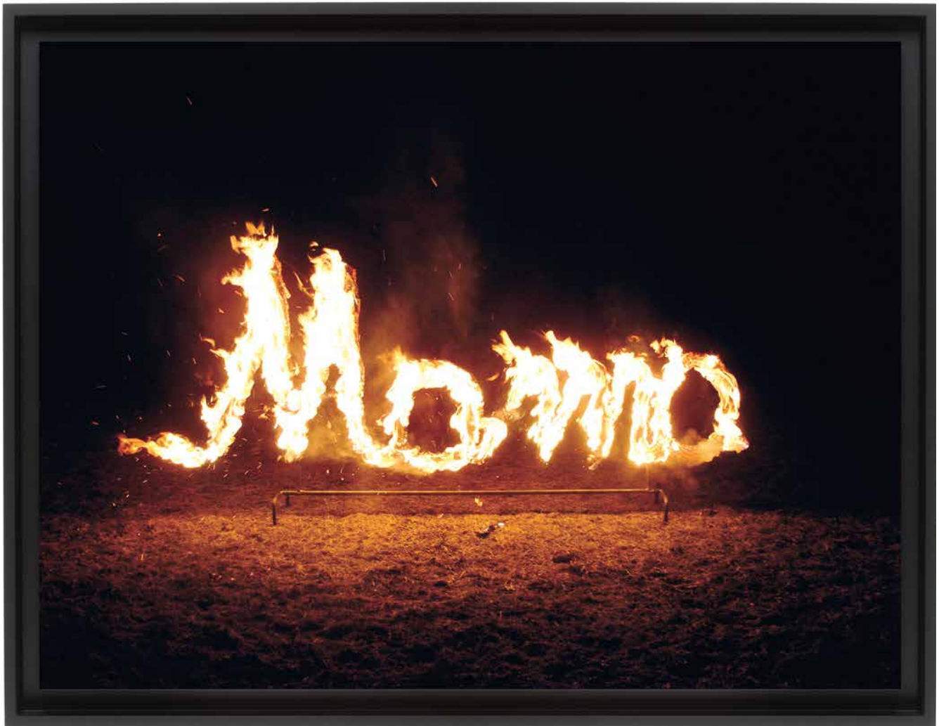
Julia Bornefeld, MAMA, 2009

The path of religious disintegration is then highlighted with "The Burning supper", which identifies the systematic end of the icon in art. The exhibition continues with the breaking of family canons with the work "Mama" and the patriarchal system with "Crown". The exhibition also touches symbolically the escape of the artist from the educational and marriage obligations with the diptych and the video "Final Play". Even the work "Ring" represents the end of the game in childhood, now replaced by the "digital media circus". A world in smoke that celebrates itself with the triptych "Fumo" admirable abstract work printed in ink on paper.